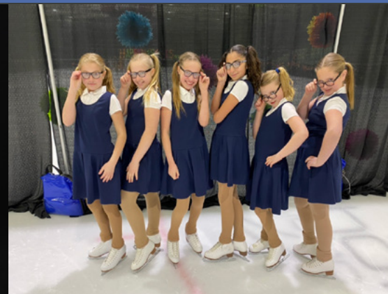
OSC Fun Skate - February 2, 2020